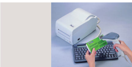
> Standalone mode with Argokee