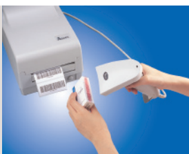
> Standalone mode with scanner